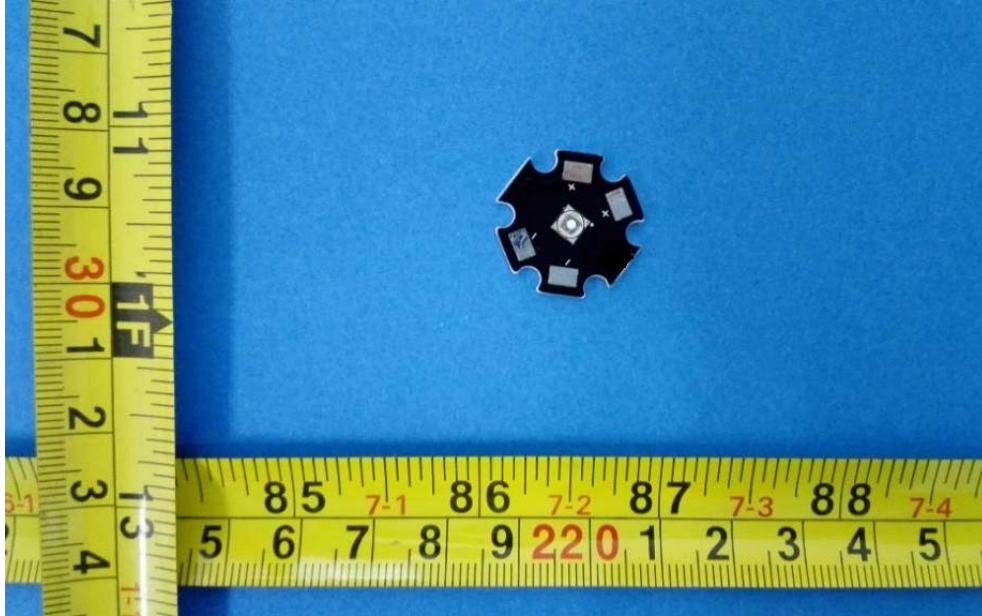
The front view of EUT